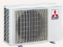
1-port MUZ-EF25/35VE(H) MUZ-EF42VE