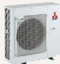
4-port | 5-port MXZ-4C80/5C100VA