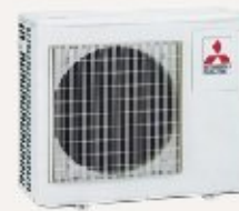
3-port | 4-port MXZ-3C54/3C68/4C71VA